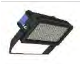
40930 CURVED BRACKET 250-300W