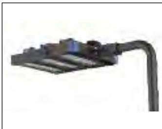
40932 POLE MOUNT