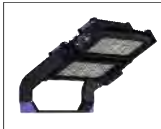
40931 CURVED BRACKET 400W