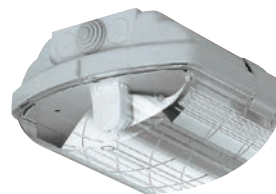
Version with concentrating reflector

The luminaires can be used in covered outdoor areas.