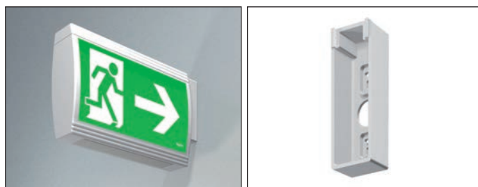
12170 SUSPENDED BRACKET