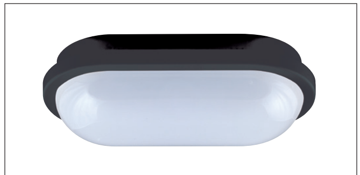
version with black frame