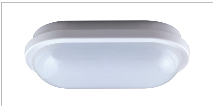
version with white frame