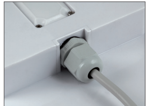
PG9 cable gland