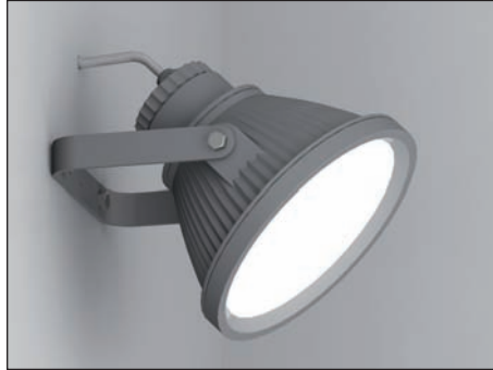
Wall / Ceiling with adjustable bracket