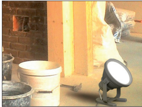
Construction site light