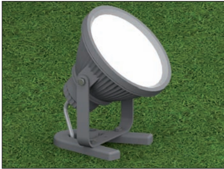
Ground with spyke