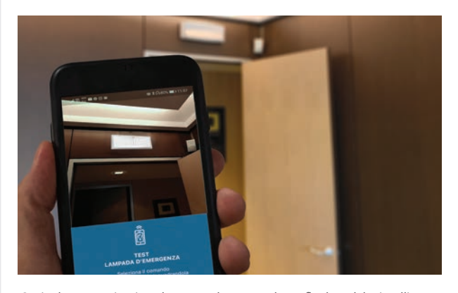
Optical communications between the smartphone flash and the intelligent light sensor integrated in compatible emergency luminaires