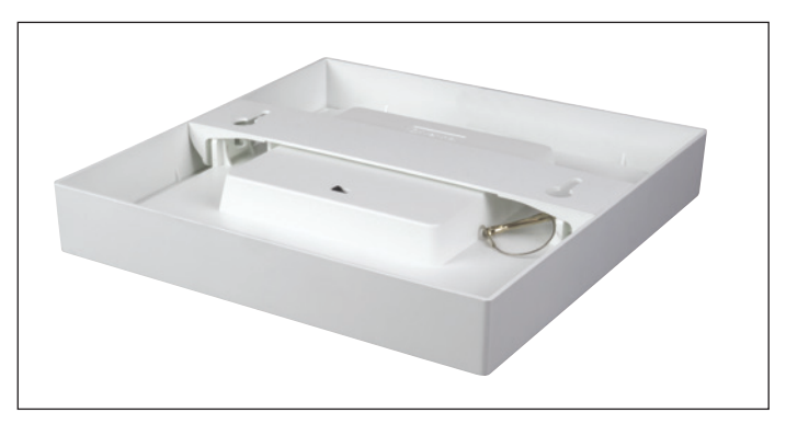
Quick mounting bracket for ceiling installation Switch to select the desired color temperature