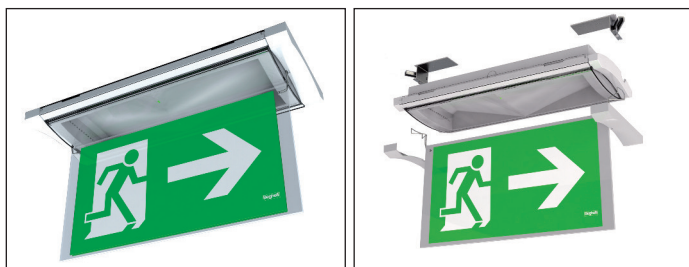
19049 CEILING BRACKET F65