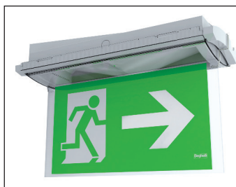
19045 WALL BRACKET