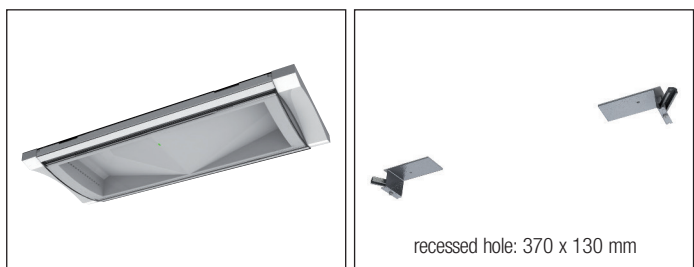
19049 CEILING BRACKET F65