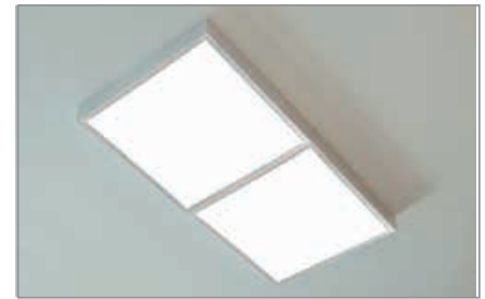
Ceiling Frame kit, part number 70014