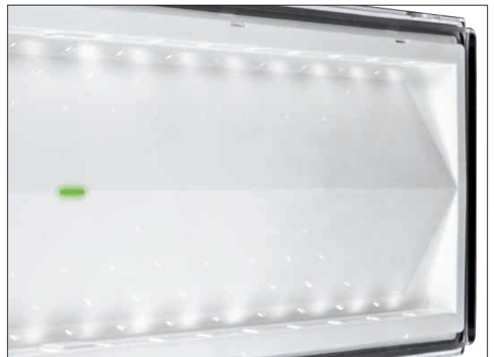
CUNEIFORM DOUBLE REFLECTOR WITH LED SIGNAL